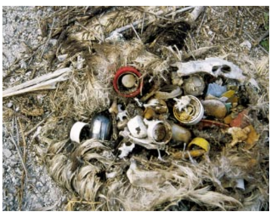
ADRIFT. Floating on the high seas (far left), plastic can tempt animals like this albatross, dead with flotsam in its belly.

the surface with fine collecting nets. Across hundreds of miles of ocean, they counted roughly a million pieces of plastic per square mile, almost all of it less than a few millimeters across.